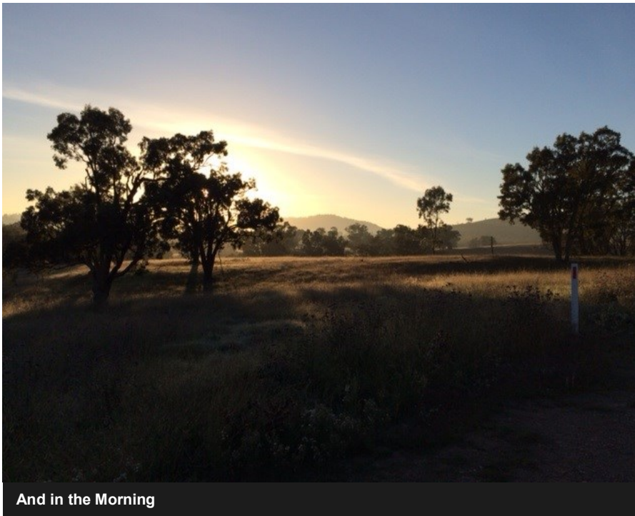
And in the Morning